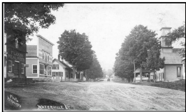
(above) view of historic Main Street with street trees, a sidewalk on the west side of Main Street

Soon the Village will have a chance to “try out” crosswalks, sidewalks, and extra on-street parking at the Common and the intersection with Church Street. A high-visibility crossing zone and shared ped/bike shoulders will be piloted for a two-week period in late summer. The pilot will demonstrate that connecting the community also helps to slow traffic. Participation in this program could speed up getting permanent facilities in the Village. Look for the pilot this fall, and opportunities provide feedback!